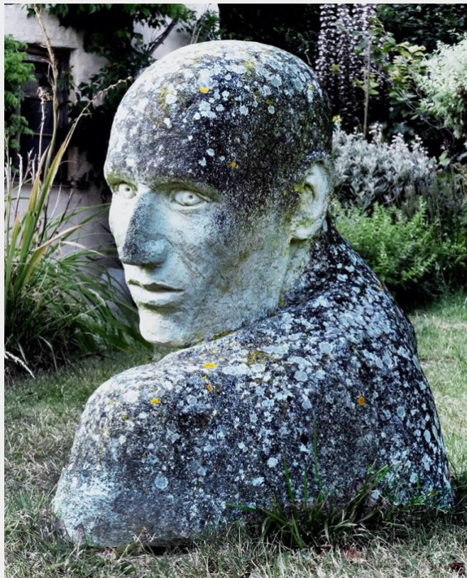
Winspit Man (Height 75cm) Damion Viney, 2014