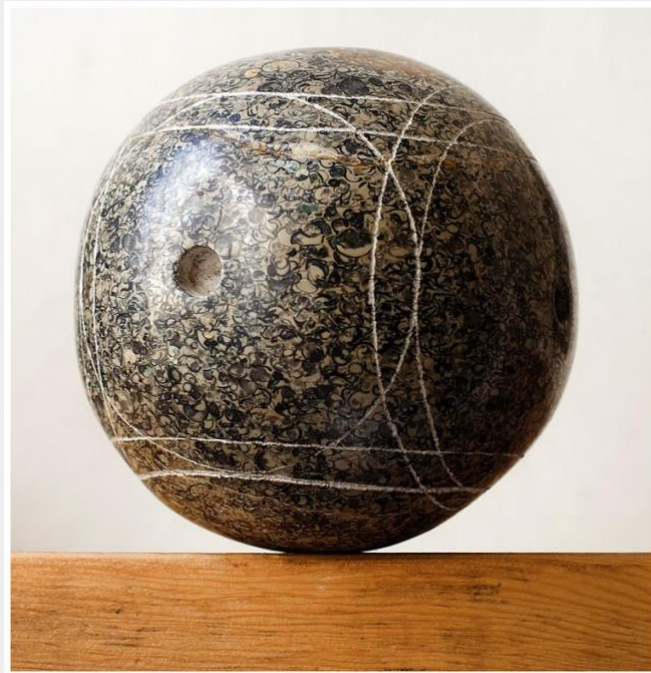
Sphere (9cm diameter). Blue Purbeck Marble Damion Viney (Tony's son) 1992